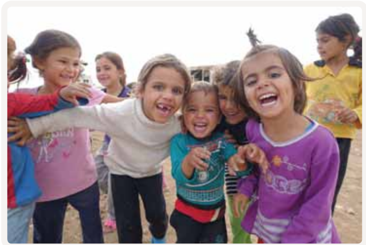
With your support, LSESD can provide protection to children living as refugees in the Bekka Valley.