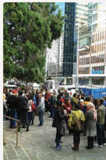
Some English students assembling outside Flinders Street Baptist Church.