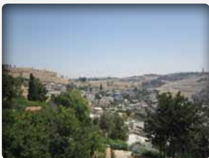
Hills of Jerusalem

For the sake of the house of the Lord our God, I will seek your prosperity.