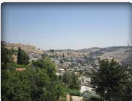
Hills of Jerusalem

For the sake of the house of the Lord our God, I will seek your prosperity.