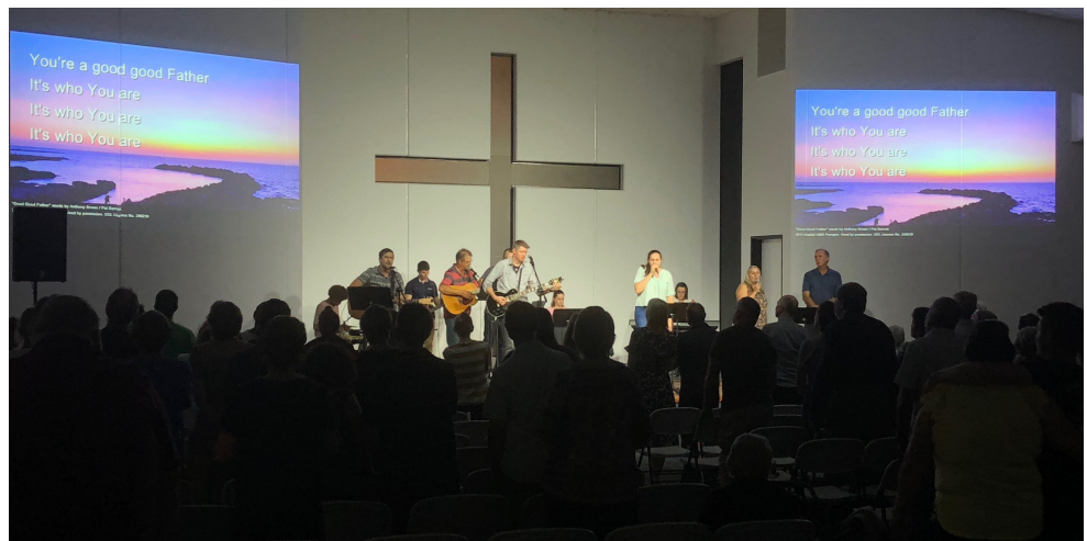
Celebrating the completion of the new facilities at Cornerstone Christian Fellowship (NT)