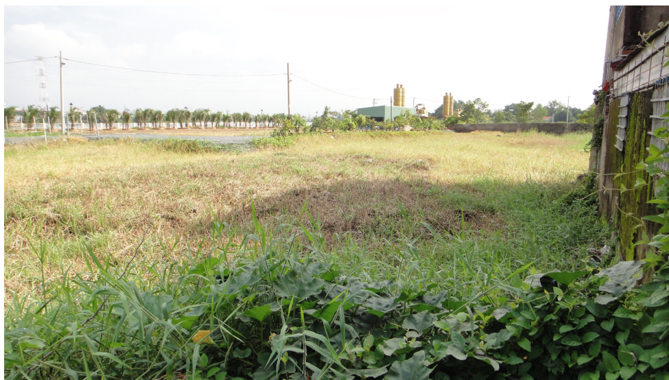
The land for the House of Grace facility for displaced children

Be in prayer for discernment and guidance for all aspects relating to planning and delivery of COG service over the next several years.